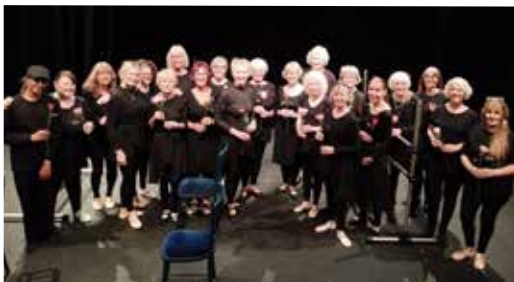
50+ Festival Event

Dates to remember are Saturday September 27th for the IDOP-day and a period, likely-to-be, September 20 - October 4 for the 50+ Programme ... with further information to follow.